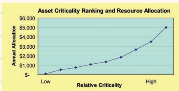
Figure 2. Annual lubrication cost commitment by machine criticality status.

As a general rule, machines are considered highly critical when human health and safety is at risk with failure, when environmental safety is at risk, when the cost of production time is very high and/or cannot be replaced and when the cost of machine repair is particularly high.