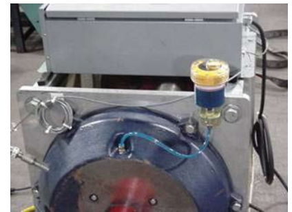
Figure 9 | Single Point Lubricators

There are various methods that may be selected to add the required quantity to the designated component. The high volume and short frequency applications benefit most from some form of automatic lubrication supply. Semiautomatic (single point automatic lubricator), as shown in Figure 9.