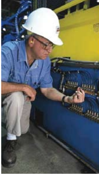
Figure 10 | A Multipoint Progressive Grease Lubrication System

(based on gear pitch line velocity), the greater the quantity of lubricant. Also, the larger the gear surface, the greater the required quantity of lubricant.