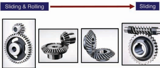
Figure 1 | Common Gear Types and their Frictional Characteristics

Each design carries its own strengths and weaknesses and imposes slightly different challenges to the lubrication and reliability engineer. The designs, as noted in Figure 1, from left to right, include a spur, a right-angle spur, a right-angle bevel gear and a worm gear. The degree of sliding force increases as the degree of curvature of the gear tooth increases, with the worm gear presenting complete sliding engagement.